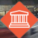
URBAN RESTORATION & RECOVERY