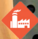
INDUSTRY & SERVICES