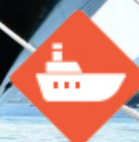
AUTOMOTIVE & BOATING